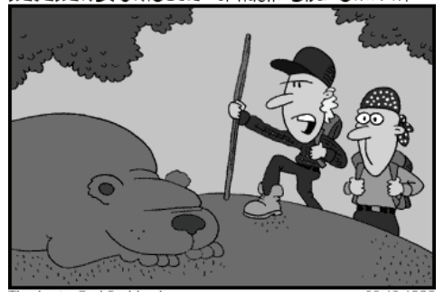
JUST ANOTHER BEAR WE HAVE TO CROSS